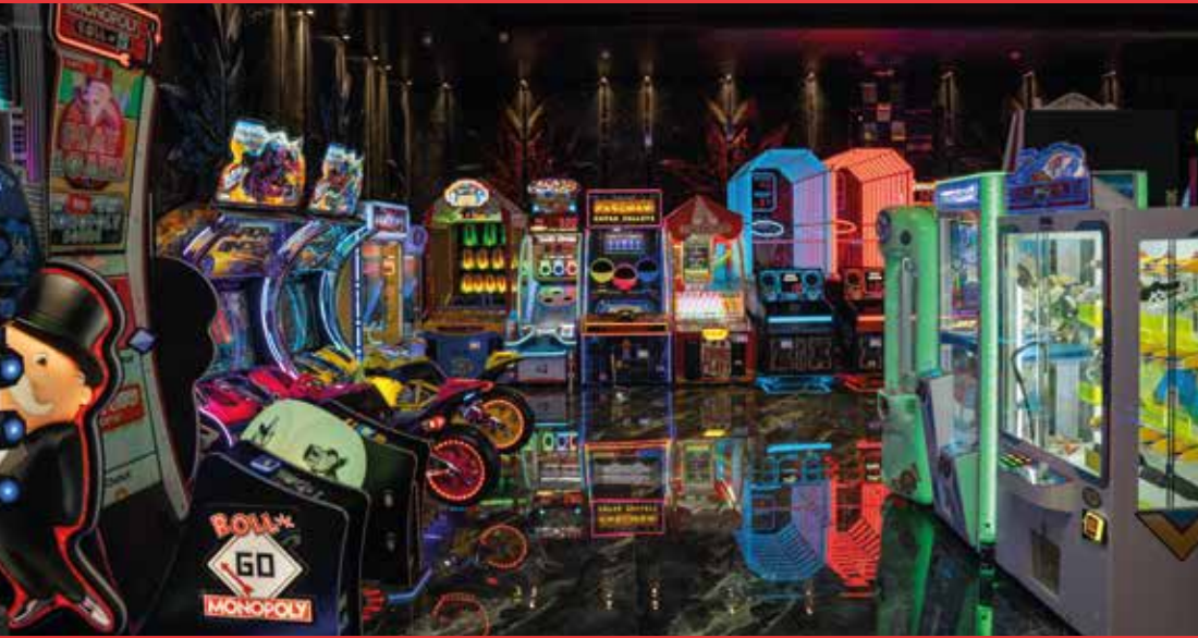
Family Entertainment Centre

Let's bring fun to your location. No matter how big or small.