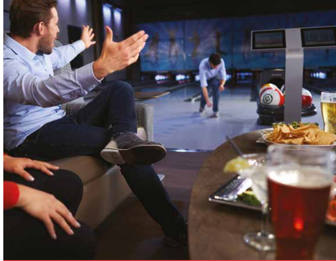
Restaurants & Bar