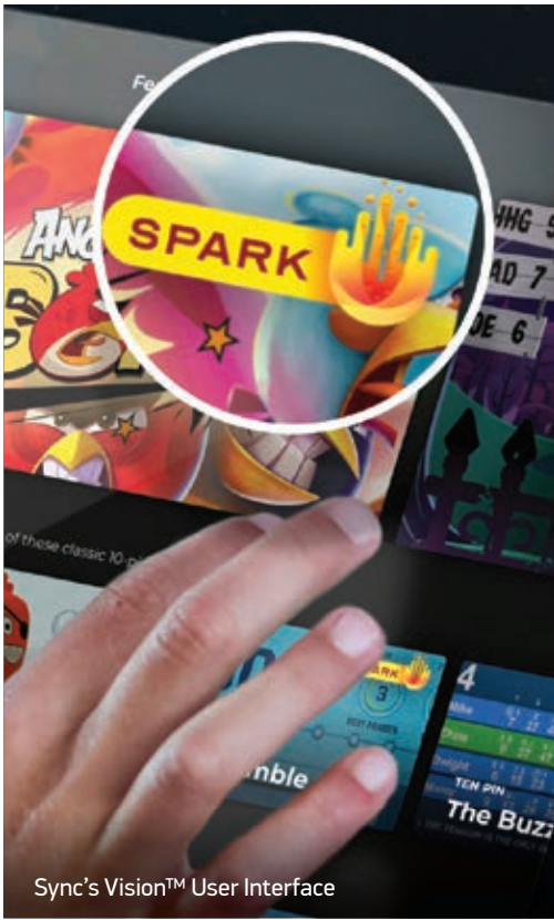
Sync's Vision™ User Interface